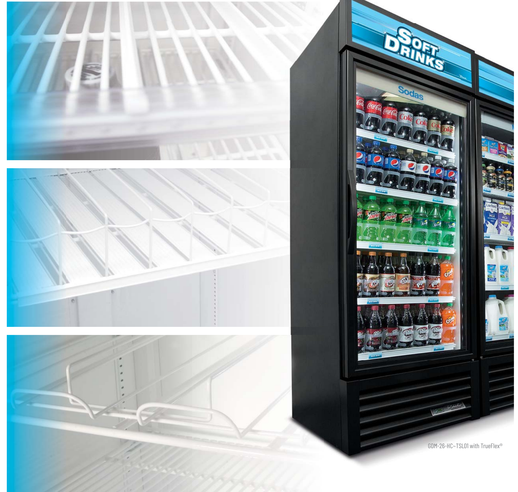
GDM-26-HC-TSL01 with TrueFlex®