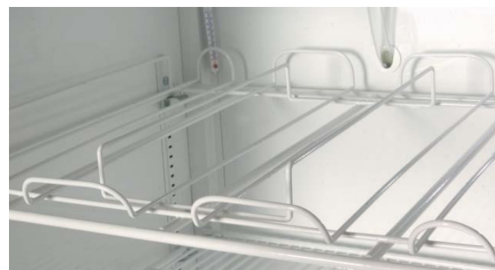
Horizontal Can Organizer