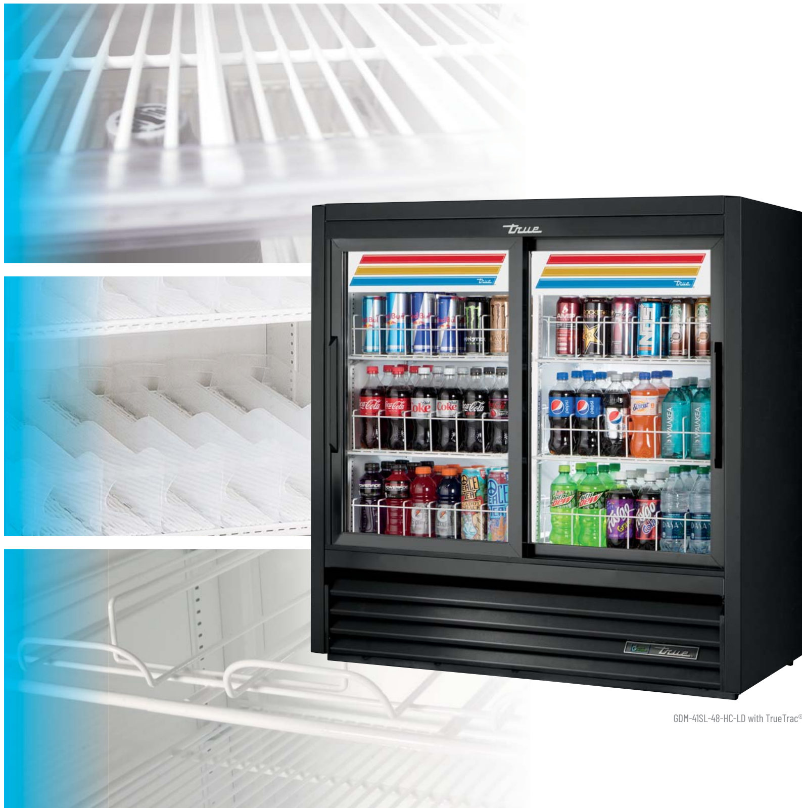
GDM-4ISL-48-HC-LD with TrueTrac®

TrueFlex® | True Flex-Pac® | TrueTrac® | Horizontal Can Organizers