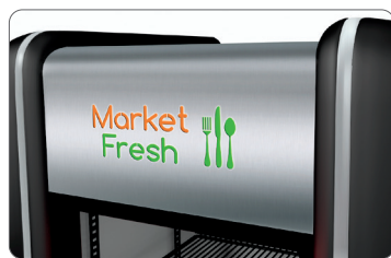
Sign: Market Fresh