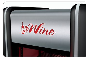
Sign: Wine Red