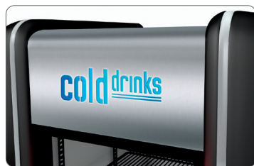
Sign: Cold Drinks