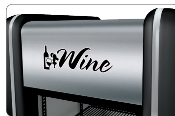
Sign: Wine Black