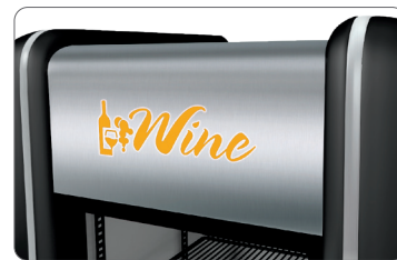
Sign: Wine Gold