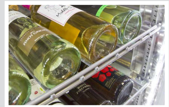
Wine shelves only available for VLD models.