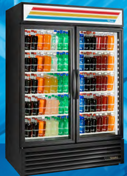
GDM-49-HC-TSL01 Unit shown with optional additional shelves.

† In order to maximize load out of 20 oz. bottles, additional shelves required.