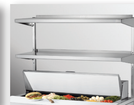
Optional Single or Double Overself Available