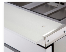
8" Deep Cutting Board