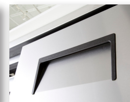
Recessed Door/Drawer Handles