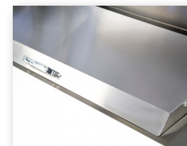
Optional Flat Top Available