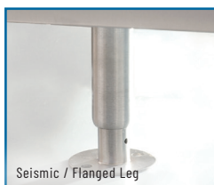
Seismic / Flanged Leg