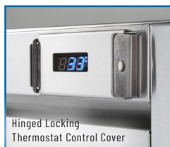
Hinged Locking Thermostat Control Cover