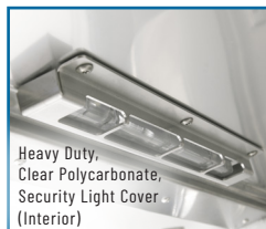
Heavy Duty, Clear Polycarbonate, Security Light Cover (Interior)