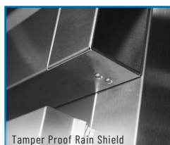
Tamper Proof Rain Shield

True's Spec Series® reach-in or roll-in models are available with special features which are designed to secure the cabinet and its components from any unintended purpose; essential in maintaining a safe kitchen environment.