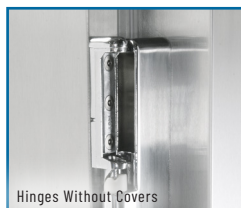
Hinges Without Covers