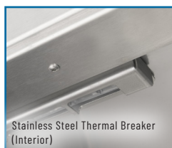
Stainless Steel Thermal Breaker (Interior)