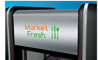
Sign: Market Fresh