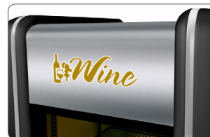
Sign: Wine Gold