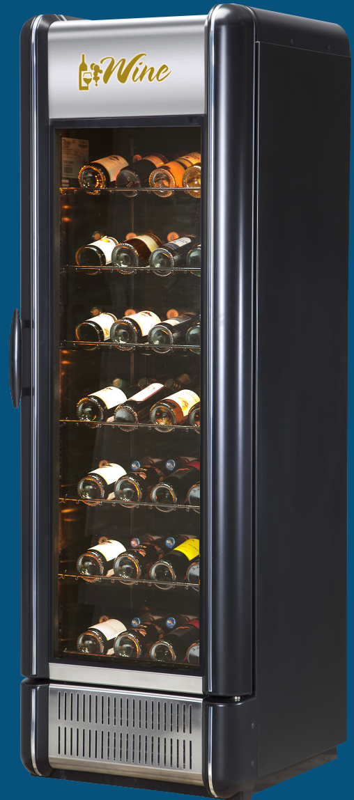
Shown with optional wine shelves