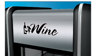
Sign: Wine (black)