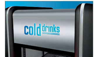
Sign: Cold Drinks