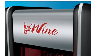
Sign: Wine (red)