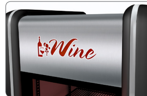
Sign: Wine Red