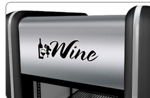
Sign: Wine Black