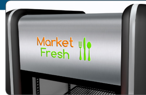
Sign: Market Fresh