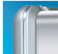
Optional Aluminum Exterior

*Optional signs are not field-installable and must be specified at time of order.