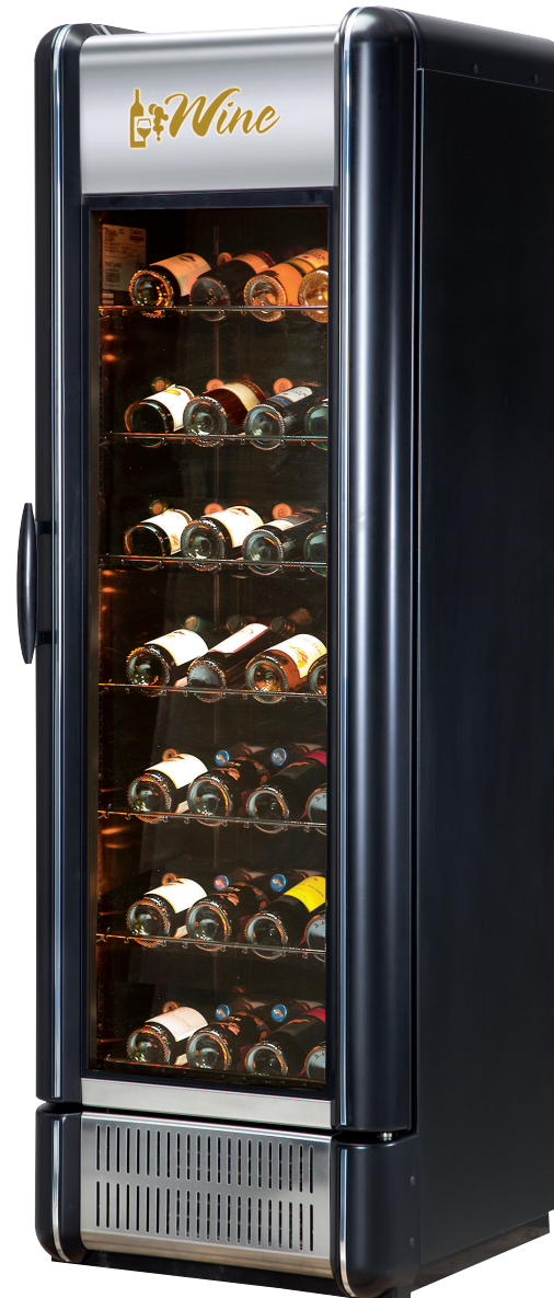
Shown with black exterior, optional wine shelves and gold "Wine" sign