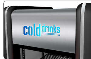
Sign: Cold Drinks