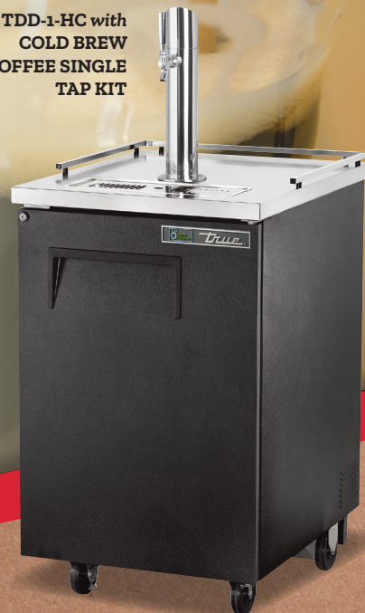
TDD-1-HC with COLD BREW COFFEE SINGLE TAP KIT

Cold Brew, Nitro and Combination Coffee kits are available for TDD and TDB models as field- or factory-installed options.